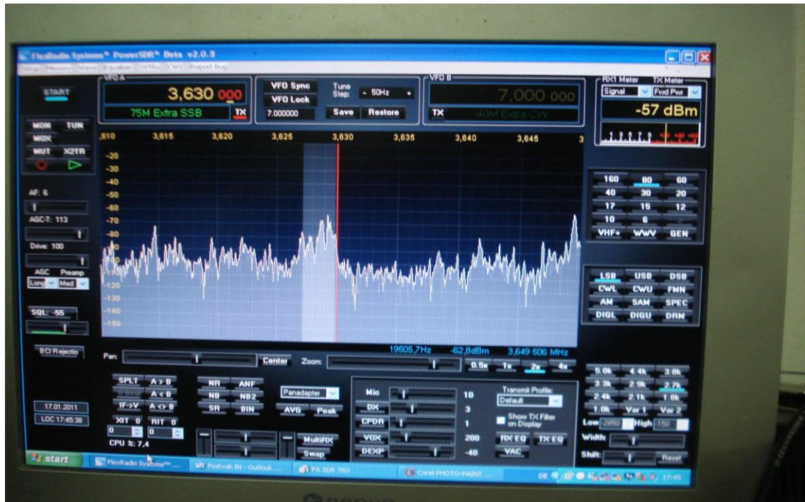
SDR Computer beeldscherm met Power SDR Software (frequentie spectrum 80 bandmeter) SDR Computer VDU with Power SDR software (Frequency Spectrum 80 Meterband)

DK4DDS at the Hamradio exhibition "Day of the Ham 2011", Apeldoorn Holland DK4DDS au der Funkausstellung „Tag von der Funkamateu" in Apeldoorn, Holland DK4DDS op de "Dag van de (Radio)Amateur 2001 in Apeldoorn Nederland